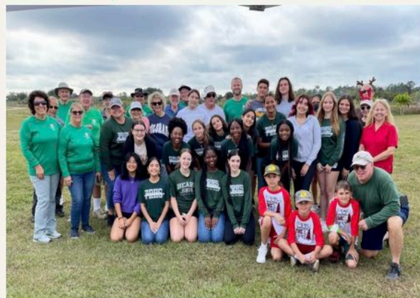
450 Christmas Meals Packed by Church & Community