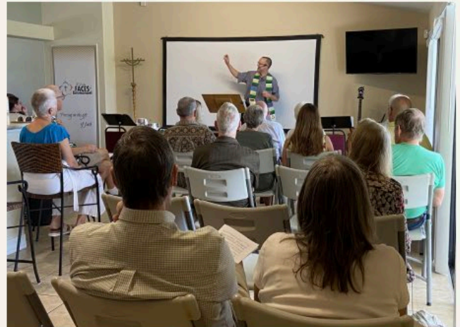
Summer Worship & Alpha in the Welcome Center