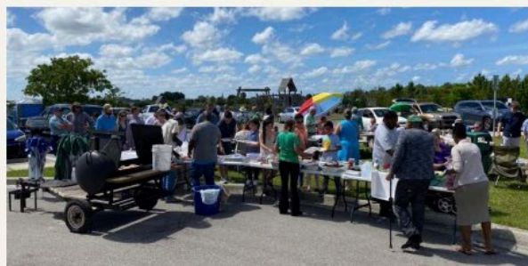
Reformation Sunday Community BBQ