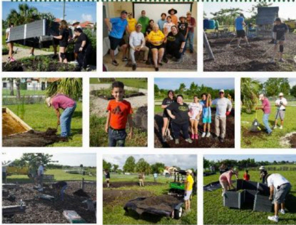
Caring for Our Park / Installing the Community Garden