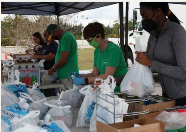
Feeding & Loving Our Neighbors for 2+ Years