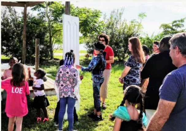
Intergenerational Sunday School