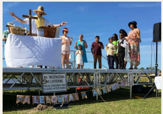
Easter Sunday First Communion (7 Children)