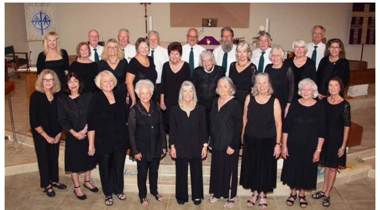
THE EMMANUEL CHOIR

On a personal note: After many years of service here at Emmanuel, I will be retiring from my ministry of service and music on May 31, 2023. I am so grateful for all the love, support, and encouragement you, the people of Emmanuel, have given me throughout this time.