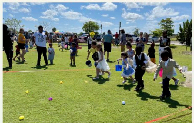
Easter Sunday Community Egg Hunt