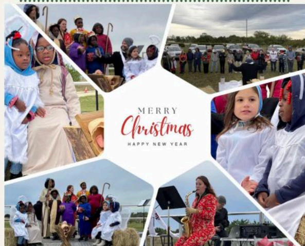
A Chilly 2022 Christmas Eve Service (48F!)